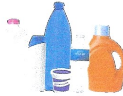
Plastic Bottles, Jugs, Tubs, & Lids (Empty kitchen, laundry, & bath containers)